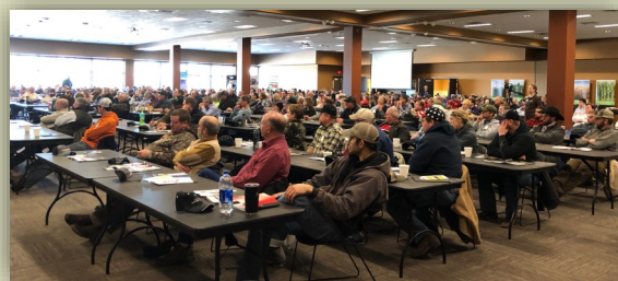
The 2018 Soil Health Conference in Watertown