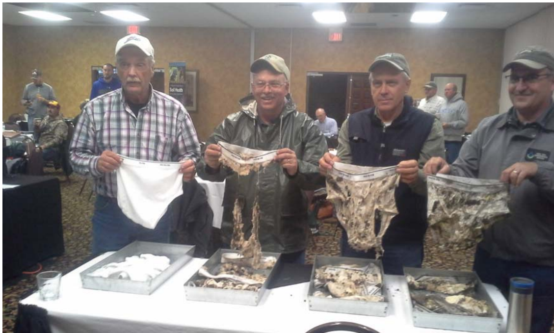
Photo 1: “Tighty Whitie” demonstration, 2016 Soil Health School, Aberdeen, SD.