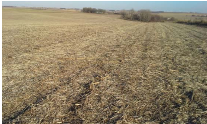
Photo of beneficial soil armor.